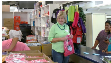
School supplies are given to those in need