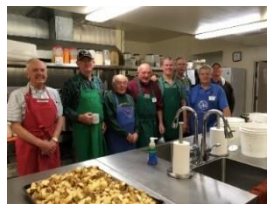
SVDP Kitchen Crew