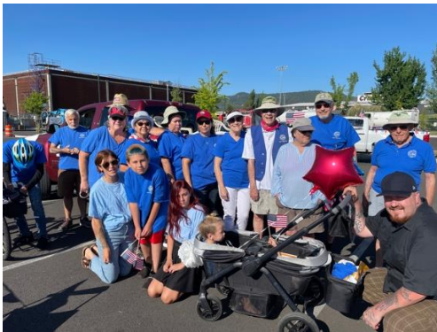
Join our Vincentian Team

We are a network of friends, inspired by Gospel values, growing in holiness and building a more just world through personal relationships with and service to people in need.