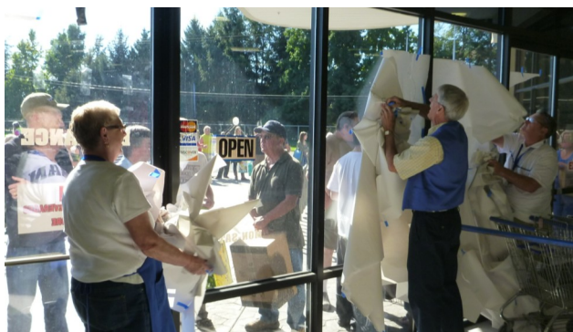
The grand unveiling of the Thrift Store before the throngs of shoppers are allowed into the Collectibles Sale. With lines like these, you would think we were selling the latest Apple iPhones.