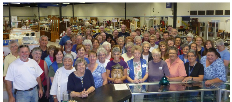
Saturday crew getting the Thrift Store ready for the Sunday rush!