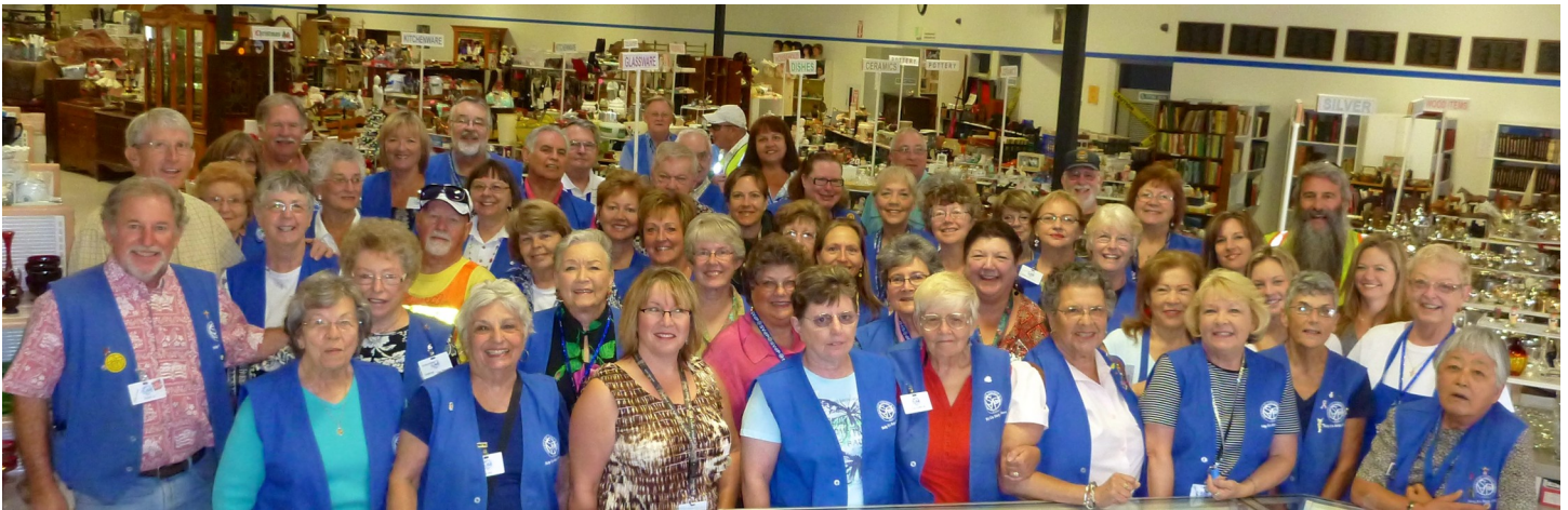
Many hands make light work, and many hands are definitely needed to help pull off the Collectibles Sale each year. Thank You All!

The annual St Vincent de Paul Thrift Store Collectible sale came to fruition again this year on October 5th. The array of choice items for sale, were lovingly saved all year for this special event and priced to sell by all the numerous department heads and helpers. In addition, over 75 percent of the stores 100 plus volunteers, worked Oct 3 rd and 4 th , to make Sunday's memorable happening, a reality.