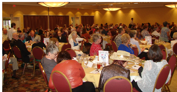
An excellent turnout! Thank you All!