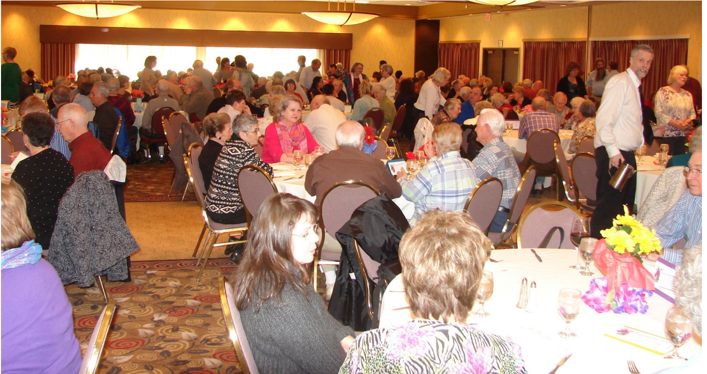
Good food, Good company, and room to Grow, Inn At the Commons did a wonderful job hosting our Appreciation Luncheon.