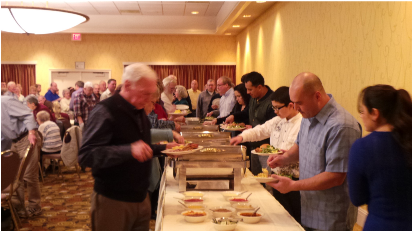
Below: Lots of good food for Good People