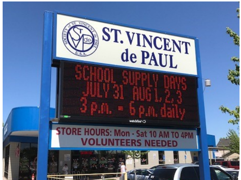
The new Electronic Sign is more visible and easier to change