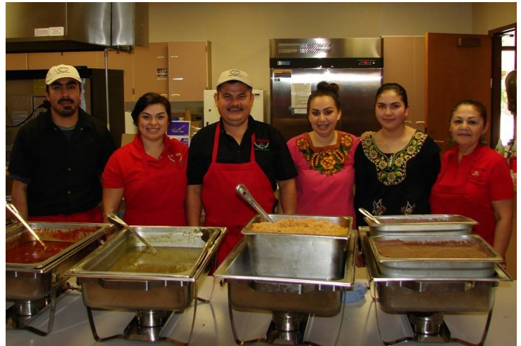
The wonderful El Molcajete crew at the Appreciation Luncheon

The service pins awards were next on the