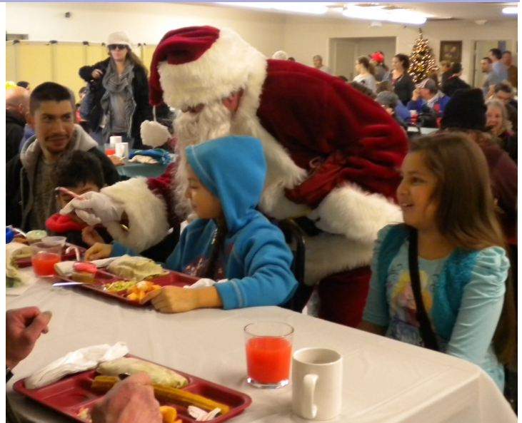
Santa handing out candy canes during Christmas Day Dinner

With the food for Christmas day pre-arranged, scheduling of volunteers was