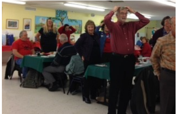
Volunteers play "Heads or Tails" at the Christmas Volunteer Party

The gathering was very well attended, and considering those from whom I heard, it was a total success. It was a truly, Merry Vincen-tian Christmas.