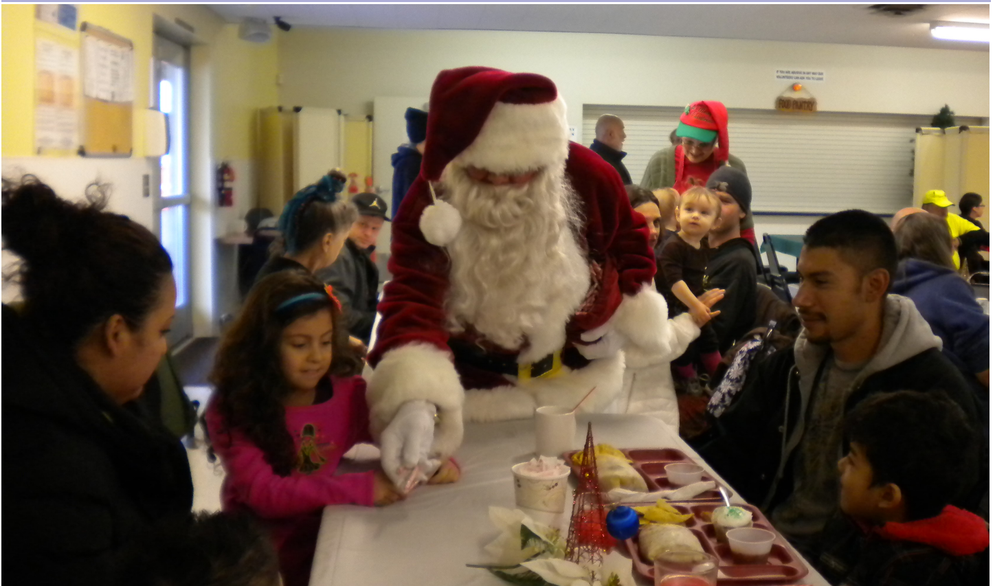
Santa giving gifts and candy canes to Christmas Day diners