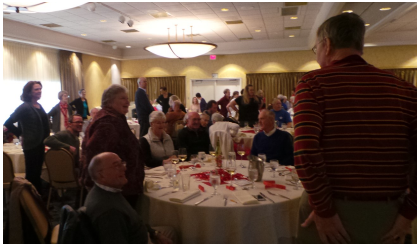
Volunteers enjoying the fun time together!